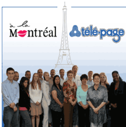
Our team - the heart and soul of Tele-Page

A: I’m starting to think we have no more common accounts. Actually, that’s not entirely true. We certainly have a strong base of traditional TAS business that represents the gamut of the traditional users, but as time goes on, we have more and more special needs business, much of it requiring more IT emphasis, customized reporting and a more sophisticated level of agent.